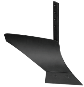
PLOUGH 588 26 67-01