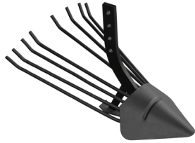
HUSQVARNA POTATOES HARVESTING PLOUGH 588 26 63-01