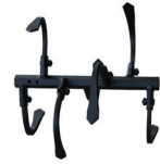
HUSQVARNA DEEP HOE KIT 588 26 72-01